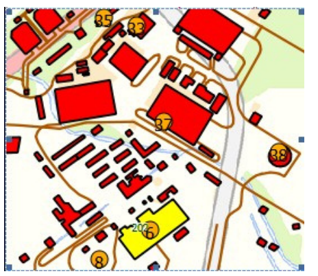
Georeferenced map of wartime Evanton Airfileld, produced by Malcolm Standring