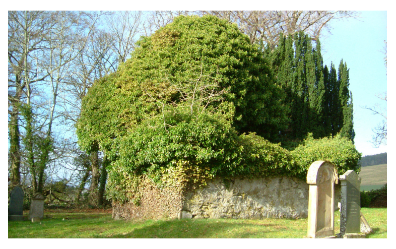
March 2013 Issue 22